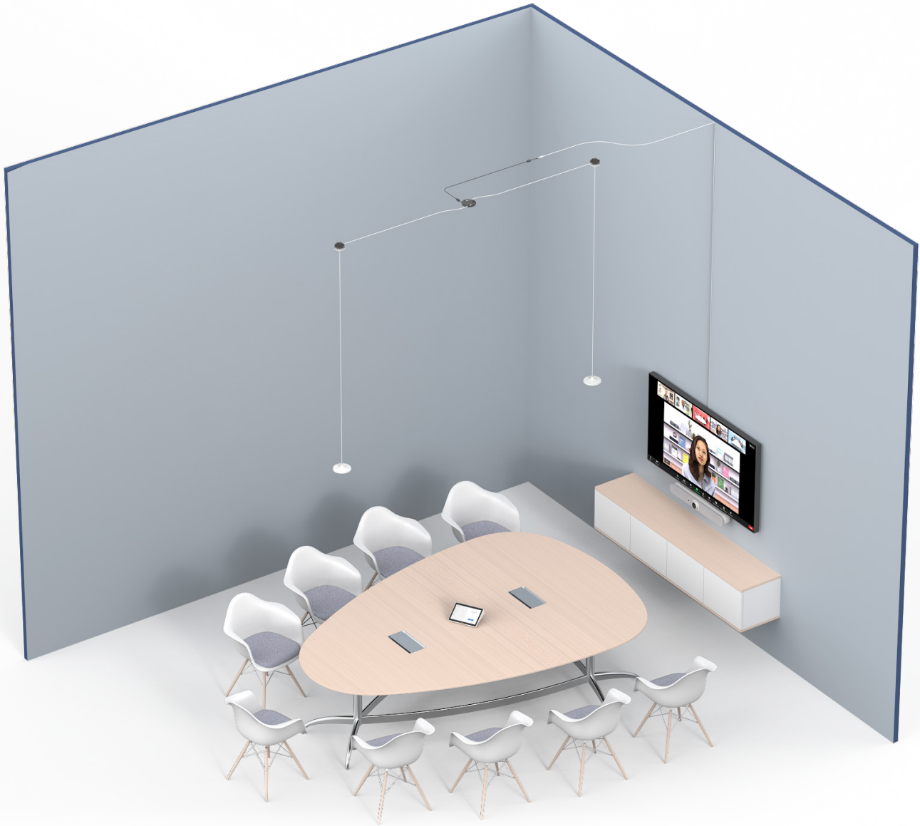
Figure 2 - Two Mic Pods with Pendant Mounts. Both Mic Pods are connected to a Mic Pod Hub, and the Mic Pod Hub is connected by a Rally Mic Pod Extension Cable. Mic Pods are spaced 2.4 meters (8 feet) apart, with the Mic Pod Hub in the middle to maximize cable usage. Note: Image not to scale.

For any configuration with a Mic Pod Pendant Mount, a Rally Mic Pod Extension Cable is recommended. Without the Extension Cable, configuration options are limited as Mic Pod cables are 2.9 meters (9.6 feet) in length.