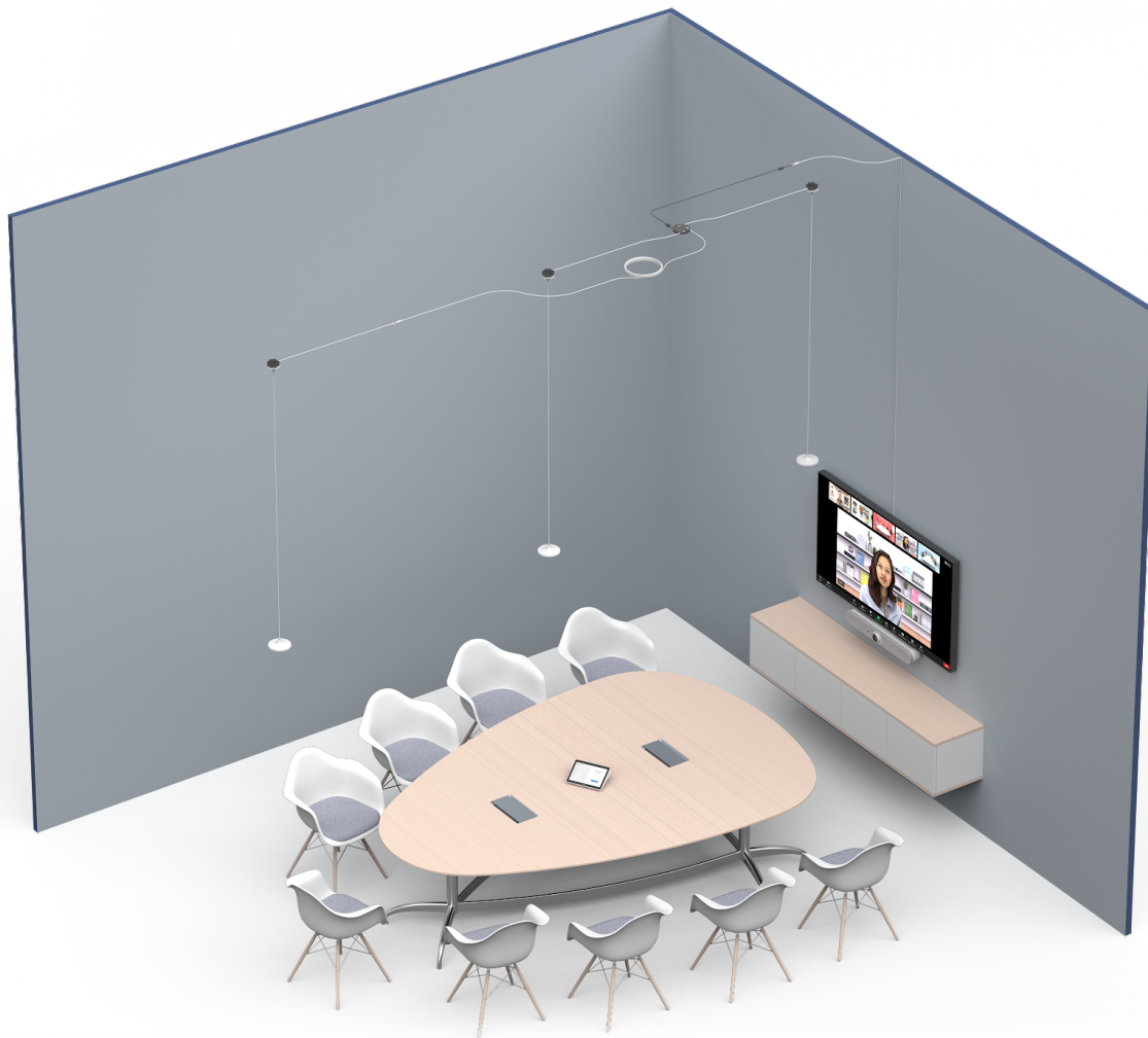
Figure 3 - Three Mic Pods with Pendant Mounts. The first two Mic Pods are connected to a Mic Pod Hub, and the Mic Pod Hub is connected by a Rally Mic Pod Extension Cable to a Rally Bar/Rally Bar Mini system. The third Mic Pod is connected to the Mic Pod Hub with an Extension Cable. Mic Pods are spaced 2.4 meters (8 feet) apart, with the Mic Pod Hub in the middle of the first two Mic Pods to maximize cable usage. Note: Image not to scale.

For more than two Mic Pods in a linear configuration, more Mic Pod Hubs or another Extension cable will be required as it is not possible to daisy chain Mic Pods in Pendant Mounts. For adding a third Mic Pod in a configuration using Rally Bar/Rally Bar Mini, an extra Extension Cable could be used, as noted in the image below. For a Rally Bar system with four Pendant Mounted Mic Pods, the third and fourth Mic Pods will need to be connected a second Mic Pod Hub and second Extension cable, respectively. If the room is using a Rally/Rally Plus system, one Mic Pod Hub will be needed for each additional pendant mounted Mic Pod. Meaning, for two extra Mic Pod in Pendant Mounts, two Mic Pod hubs will be needed, and so forth.